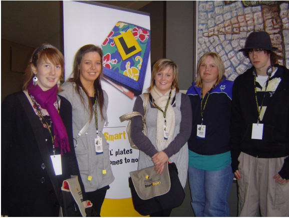
Students at the StartSmart Forum at the Uni of Tas